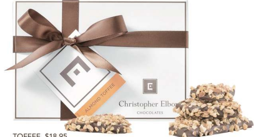
TOFFEE $18.95 roasted almond or candied pecan with dark chocolate