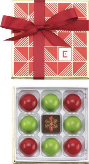
9-PIECE HOLIDAY COLLECTION $24.95 peppermint, cinnamon apple, fleur de sel caramel