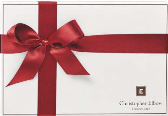
HOLIDAY GIFT BOX $94.95 9-piece holiday collection, peppermint bark, chocolate almonds, 2-piece pecan caramels, and 3 holiday bars