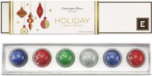
6-PIECE HOLIDAY COLLECTION $16.95 fleur de sel caramel, peppermint, gingerbread, pumpkin pie caramel