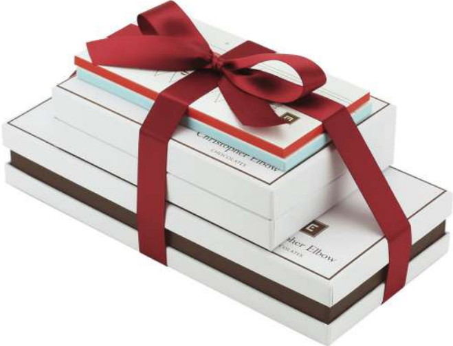
SIGNATURE HOLIDAY TOWER $85.95 21-piece signature collection, 6-piece pecan caramels, and 2 holiday bars