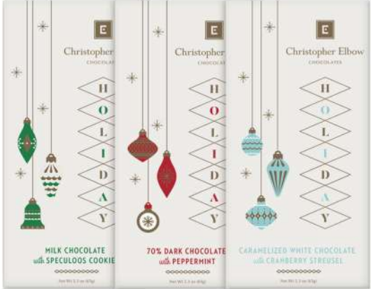
HOLIDAY CHOCOLATE BARS $7.95 speculoos cookie, peppermint, and cranberry streusel