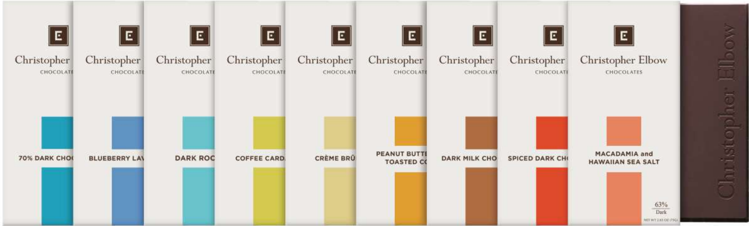
CHOCOLATE BARS $7.95