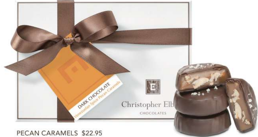
PECAN CARAMELS $22.95 sea salt dark chocolate, sea salt milk chocolate, venezuelan spice dark chocolate