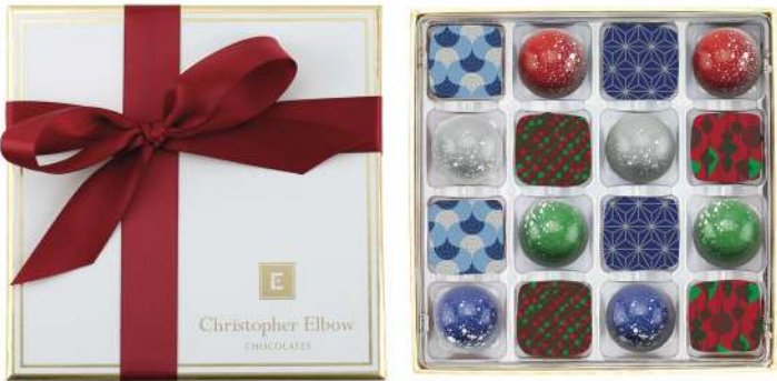
16-PIECE HOLIDAY COLLECTION $40.95 egg nog, speculoos cookie, champagne, cherry vanilla, peppermint, fleur de sel caramel, gingerbread, pumpkin pie caramel