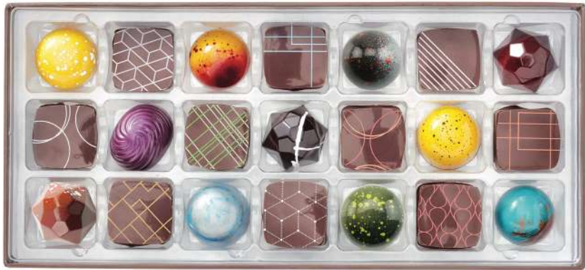
21-PIECE SIGNATURE CHOCOLATE COLLECTION $48.95