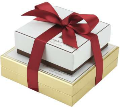
HOLIDAY BONBON TOWER $64.95 16-piece holiday collection and 9-piece signature collection